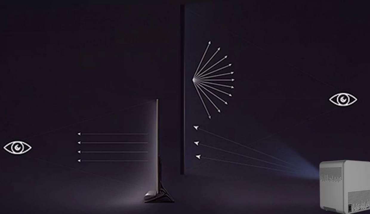
Traditional LCD TV

Reduce eye irritation, children watching movies healthier.