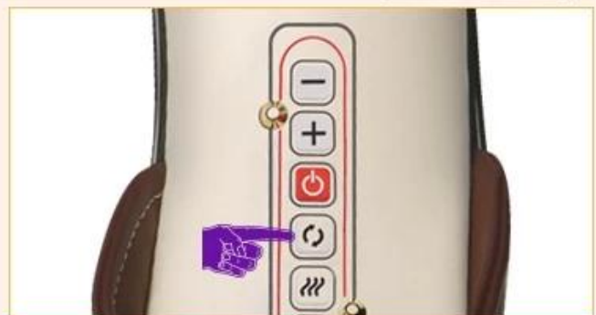
Press again, inverse massage