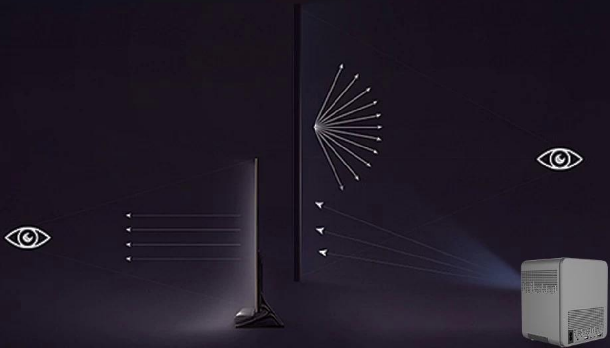
Traditional LCD TV

Reduce eye irritation, children watching movies healthier.