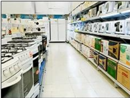
Large appliance store