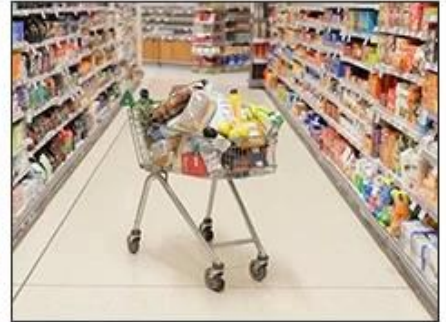
Supermarket department store