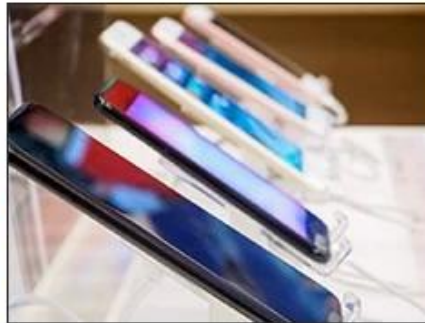
Mobile phone store