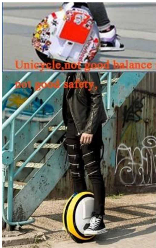
Unicycle, not good balance stability, not good safety,