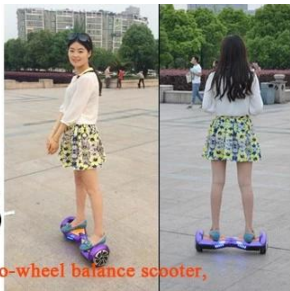
Two-wheel balance scooter, good balance stability and good safety.