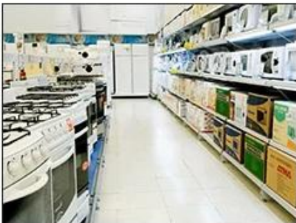
Large appliance store