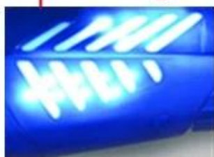
PC Coated ABS