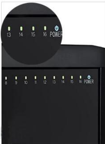
When the device is charging the green light