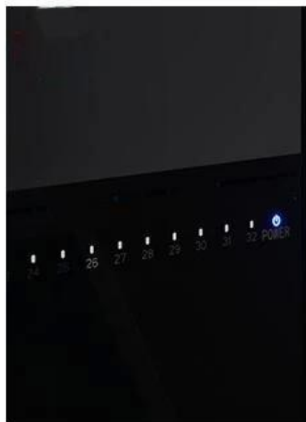
Blue light flashes when data transfer