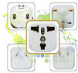
Free Travel Adapter for US/UK/AU